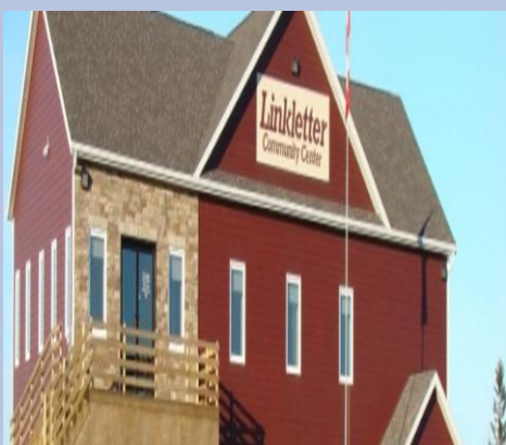
Community of Linkletter

Transfer the skills and experience of elders in aboriginal communities.