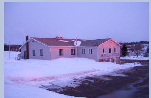
North Rustico Lions Club

Examples- Halls could sponsor seniors' activities such as community kitchens, musical lessons in the evenings or if senior activities are already happening in your hall NHSP programs can focus on equipment replacement such as new furnaces, stoves, windows or insulation. Anything that improves the experience of seniors is applicable such as paving a dangerous parking lot.